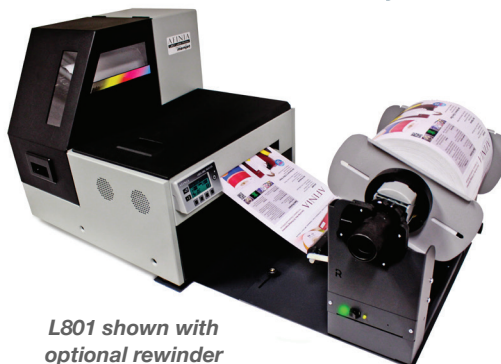
L801 shown with optional rewriter